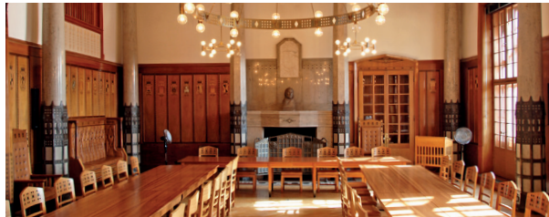
District council chamber in the government building

With the appeal procedure, we offer cost-effective and effective legal protection, particularly in parts of social law. We also manage general complaints.