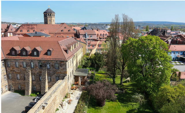
Government building and garden

We are committed to providing and promoting attractive, modern, and affordable housing – the foundation for young and old to enjoy living in Upper Franconia.